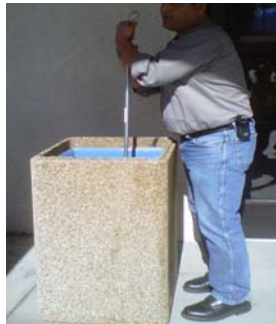
SMASH 'N GO