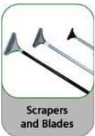
Scrapers and Blades

These scrapers were designed for glass windows, doors and floors. All come with blade protector cover. CM2556 may be used with a telescopic handle.